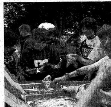
Ahhh, nothing like a My-Chosen pizza at the end of a hard day's work!