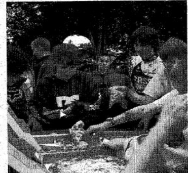
Ahhh, nothing like a My-Chosen pizza at the end of a hard day's work!

How to separate August Muse. See and find the details on July/August Evening including the Sheep Dog Trials and Metchosin Day.